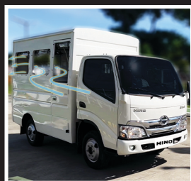
Ample Air Circulation