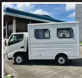
High Quality Body Construction