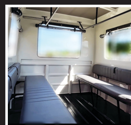
Spacious Interior for Passengers