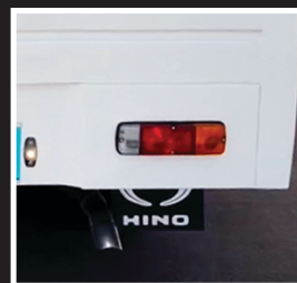
High Visibility Tail Light