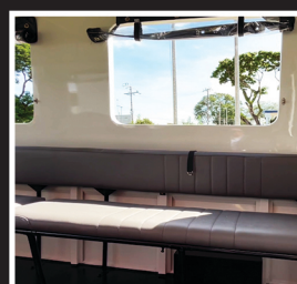
Premium Leatherette Upholstery