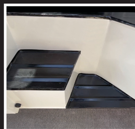
Alternate Steps for Easy Loading