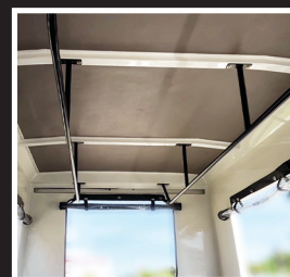
Laminate Interior Ceiling Finish