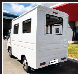
Two Options for Window : - Clear Tarp Cover and - Sliding Tempered Window